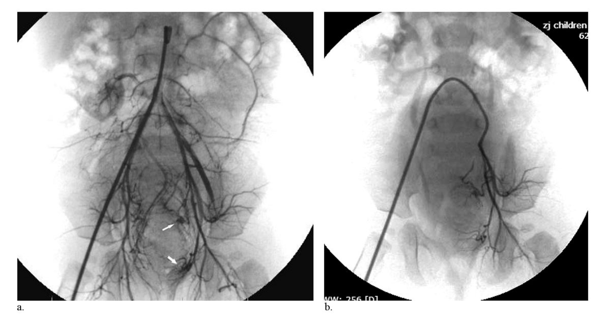
Figure 2. Images from a 14-month-old girl with a vaginal EST. (a) Aortography obtained before IAC revealed tumor staining (arrow) in the pelvic cavity. (b) The internal iliac artery was selected, and anticancer agents were slowly injected.